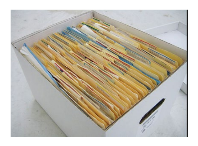
Legal size filing